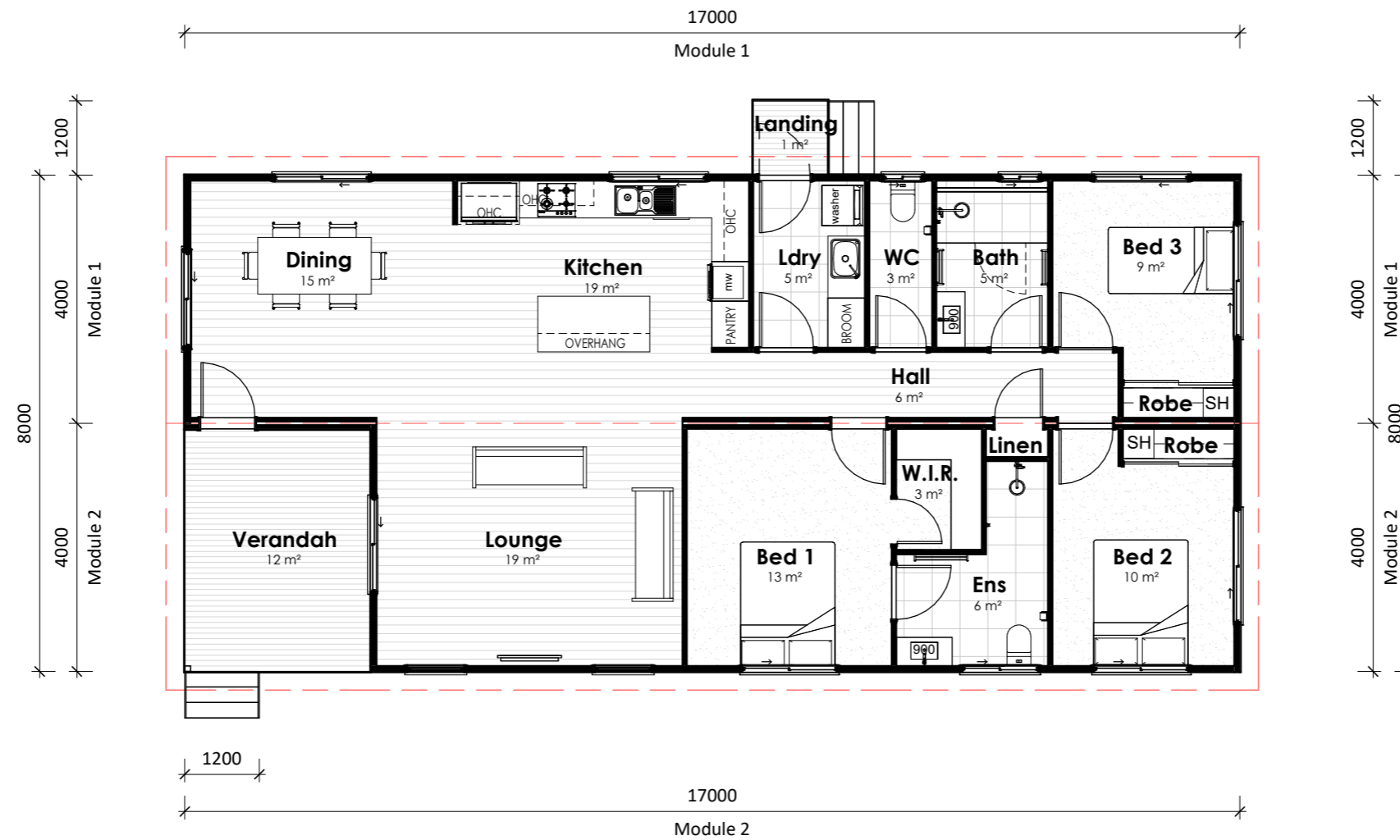
Plan Floor Plan 1 : 100