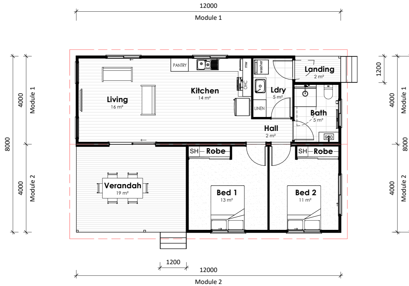
Plan Floor Plan 1 : 100