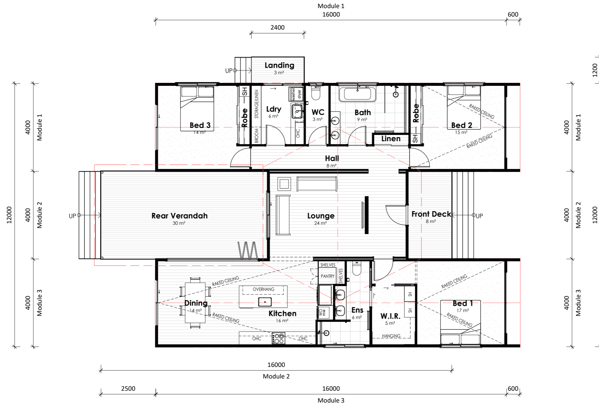
Plan Floor Plan 1 : 100