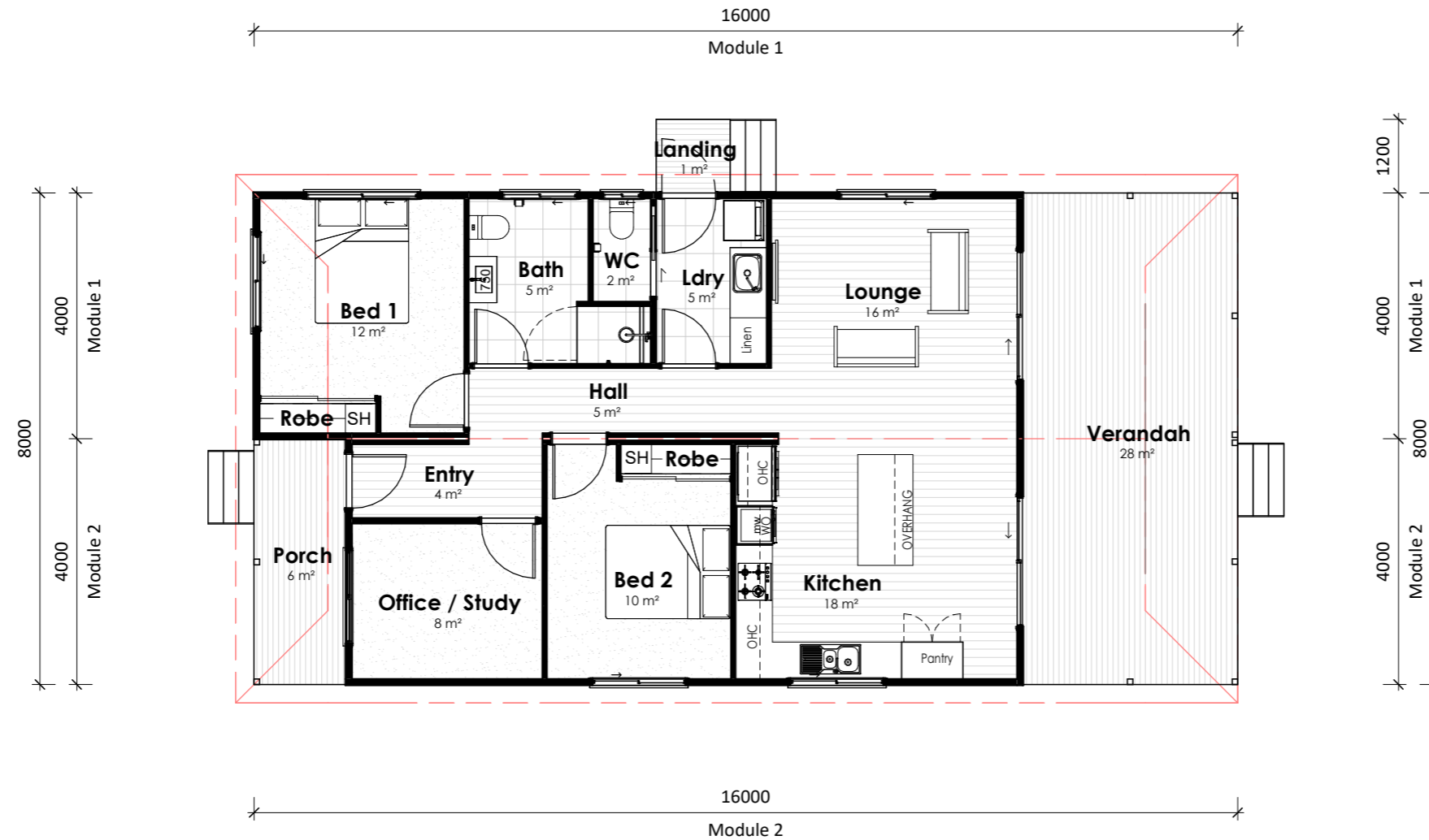
Plan Floor Plan 1 : 100